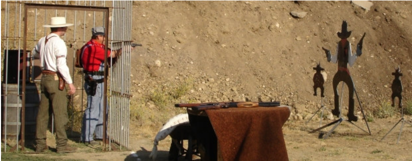
The Tujung Kid Robs the Bank