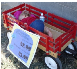
Taking a Break