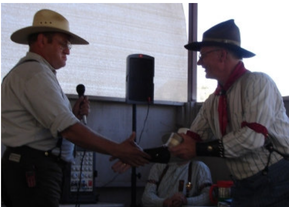
Mountain Rider Receives some Soap for a CLEAN Match!