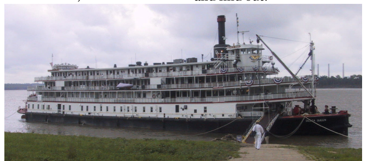
Left-Oak Alley; Above-Delta Queen