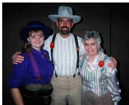
Holy Terror, Mid Valley Drifter, & Wicked Felina