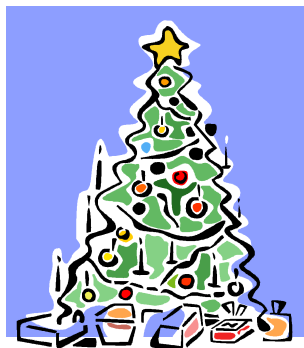
Don't Forget the Steal-A-Gift Game!

and the December Shoot. The Cowboy Christmas Celebration is December 11th at the IOOF Hall in Jacksonville. Put on your finest cowboy attire and join us for a Christmas style potluck dinner starting at 6pm. Cowboys and girls with a last name from A to M please bring a side dish