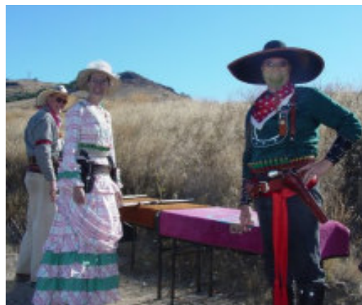
Fashionably Waiting at the Loading & Unloading Table