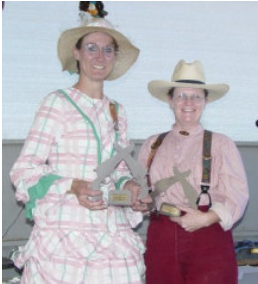
Ladies Man-on-man Shootout Winners