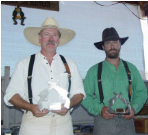
Mens' Man-on-man Shootout Winners