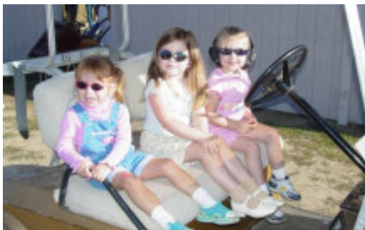
The Youngest Waddies in SLS History