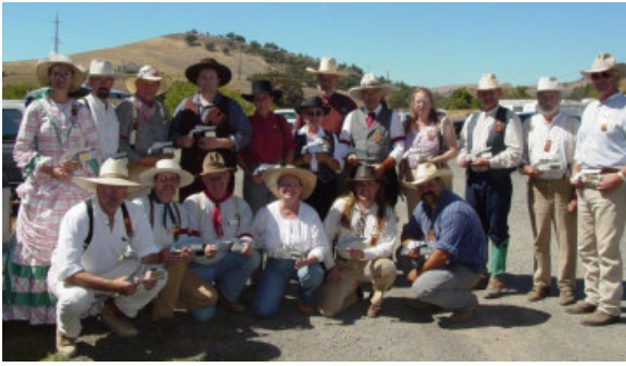
1st Place Winners