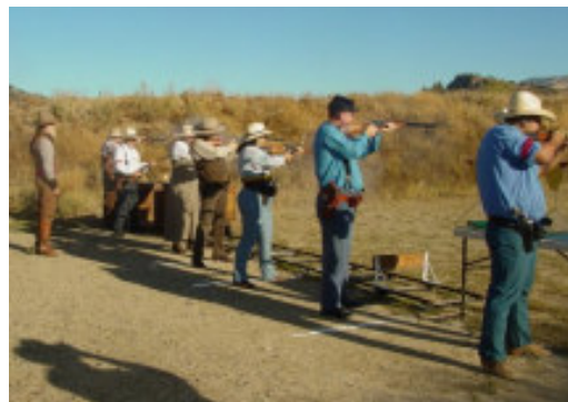
Tribute to Siskiyou Mac