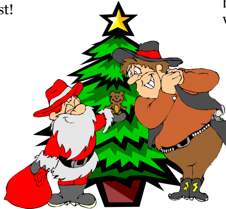
Don't Forget the Steal-A-Gift Game!